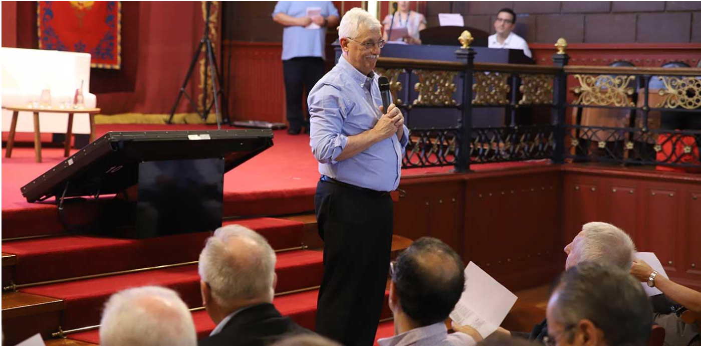
Father General Arturo Sosa blessed the attendees at the prayers that started off the event on Tuesday, 10 July.