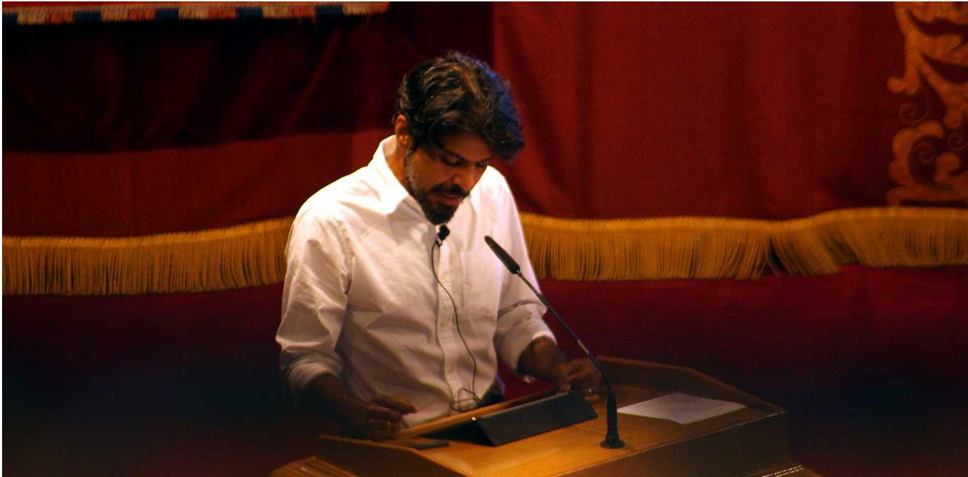
The writer Pankaj Mishra.