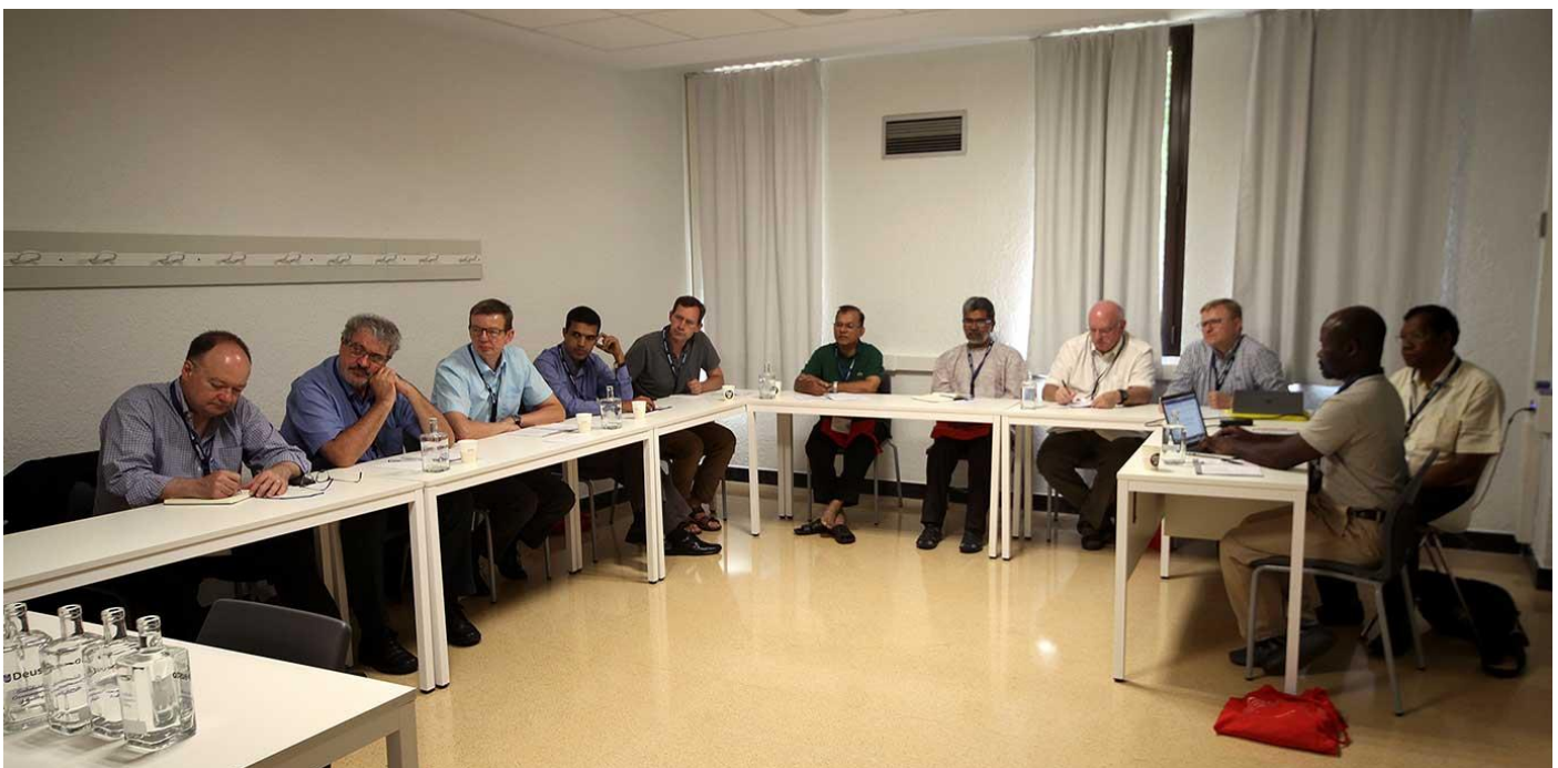
View of the one of the group work sessions.

Today's activities continued with the working sessions on the six key thematic areas of the Assembly: "A university background in leadership", "Civic and political leadership", "Economic and environmental justice", "Education of the excluded and poor", "Inter-religious dialogue, collaboration and understanding" and "Peace and reconciliation".